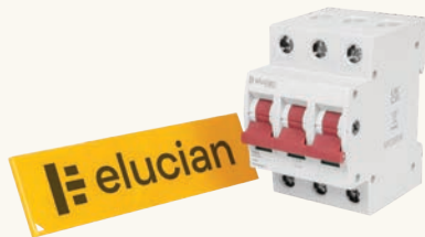
*TPMS3125KS example shown.