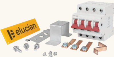
*TPMS4125K example shown.

*For use on 4 & 6 Way Distribution Boards only.